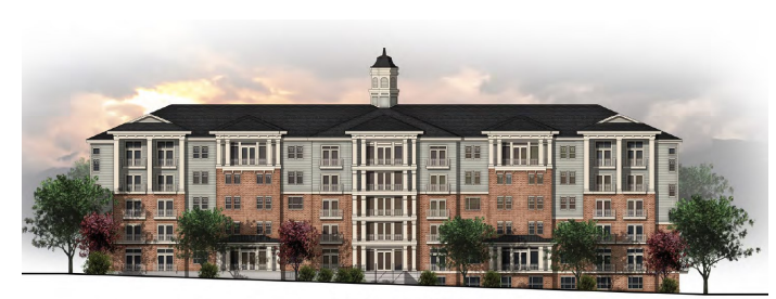
BUILDING A - SCHEME :